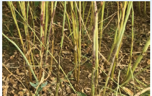
AHDB disease control